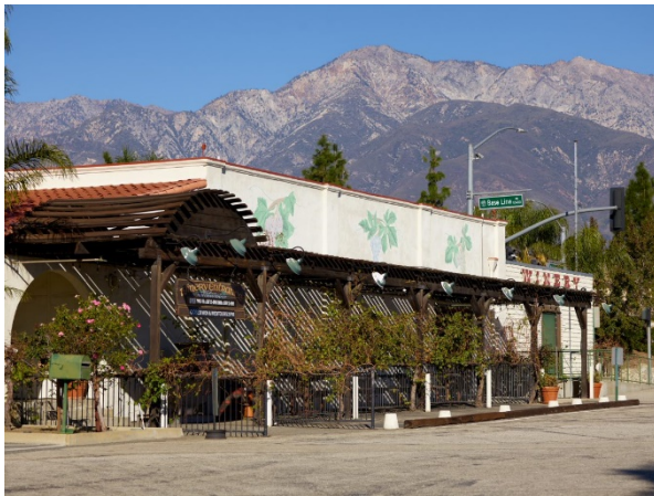
Figure 3 Current winery building entrance, looking north to Base Line Road and the mountains

The City envisions that winery-related business operations will be part of the program. Wine production does not need to continue on site, but an experienced vintner will need to be brought to the project.