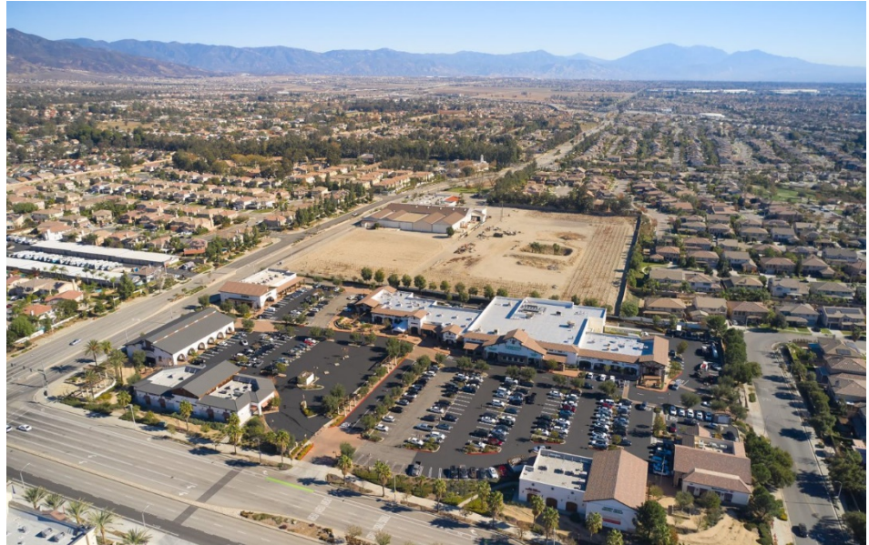
The winery site looking to the east. The property is bordered on the west by a shopping center anchored by Sprouts Market.

Through this vision statement the City envisions a community that is balanced, with a wide variety of housing, recreation, entertainment, and employment to serve the needs and preferences of the community; a vibrant community that is active, interesting and exciting; a city in which people and businesses can continuously innovate and evolve,