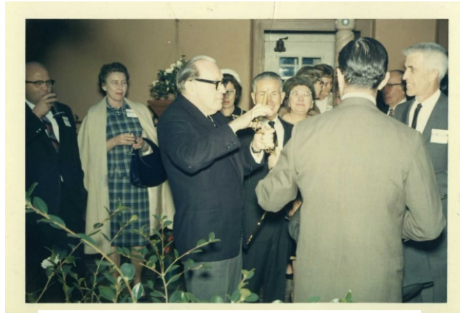
Figure 2 - In this 1966 photo, Jack Benny visits the Regina Winery.

While the winery function existed prior to 1949, its primary significance dates to the period 1949-1971, when the facility produced a national brand of wine vinegar under the Regina label and the winery itself became a popular destination point for tourists. The 1949-1971 period of significance does not meet the National Register’s 50-year requirement and the property does not meet the criteria of exceptional importance.