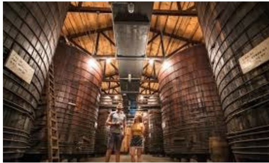
Figure 1 Inside the barrel room. These barrels have been restored by the J Filippi Winery and are among the interesting features of the winery that might be kept and reused in future development.

The property was purchased in 1993 by the City’s Redevelopment Agency. Soon after, the winery was leased to the Filippi family and began operations as the Joseph Filippi Winery and Vineyards. Since that time, the Filippis have worked to revitalize the old vineyards, plant new vines, and operate the winery at the location pursuant to the lease. Since 1922, the Filippi family had grown grapes and made wine in the Cucamonga Valley at other locations in the area.