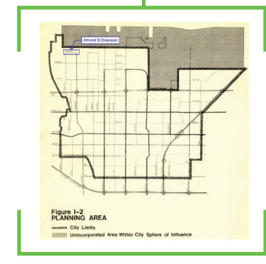
Project identified in the City's first-ever General Plan highlighted the need for a connection along Almond Street