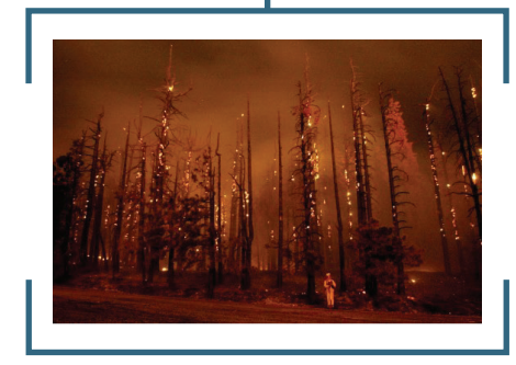
Grand Prix Fire burns near Almond Street, highlighting the need for alternate evacuation routes, including the Almond Street connection identified in the General Plan