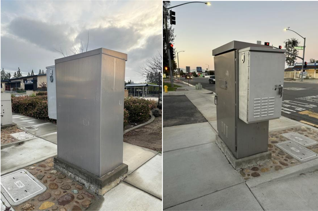
(sample front and back of a utility box)

Artist will be responsible for design elements on all four sides of the utility box including attached exterior cabinets. Below you will find a sample image of a utility box and the design template which is linked on the call for artist page.